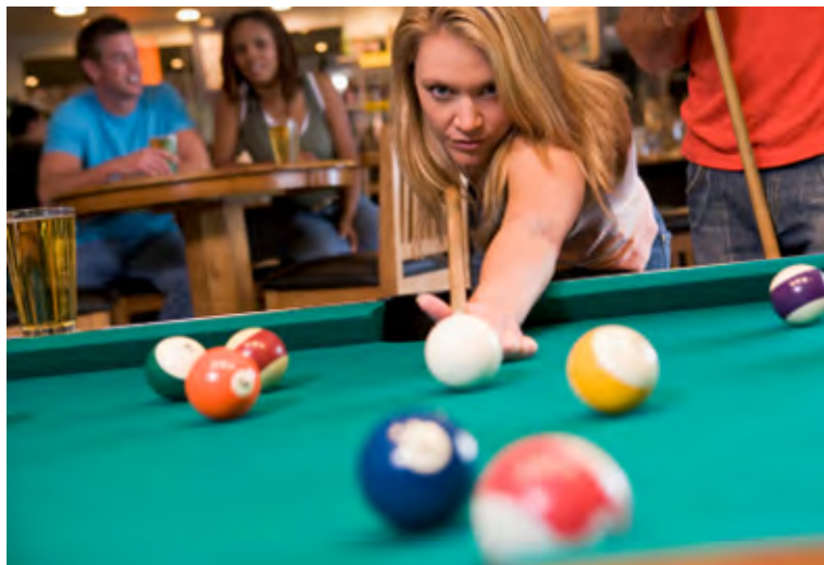
The new Pool room on second floor.